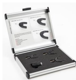
Spine applicator set