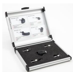
Fascia applicator set